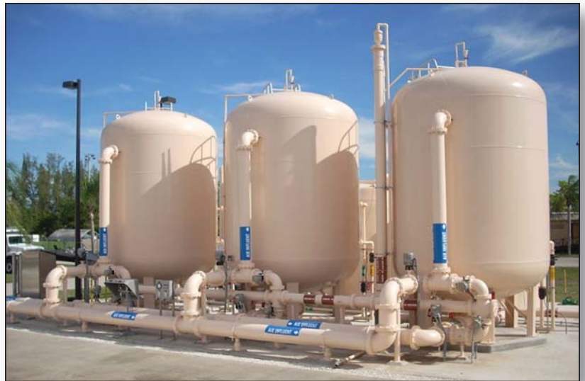
4 MGD ORGANIX™ Installation