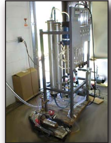
Cross-Flow Membrane Pilot Skid (RO / Nanofiltration)