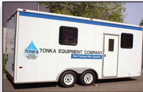
Tonka Pilot Trailer