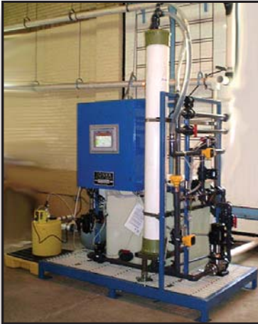
Hollow Fiber Membrane Pilot Skid

Prior to the start of the pilot study, a comprehensive pilot protocol is developed by Tonka and shared with the consulting engineer. An experienced Tonka professional then performs the on-site pilot study and collects samples. A complete report from our Engineering Department is available within two weeks after receipt of laboratory data. The report includes process recommendations and discussion of process efficiency.