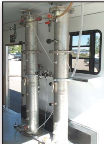
8" Filter Columns