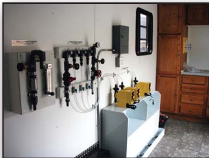
Chemical Feed Injection

Complete systems can be crated and shipped to be erected on site. Fully equipped pilot trailers are also available for remote sites or when indoor space is limited.