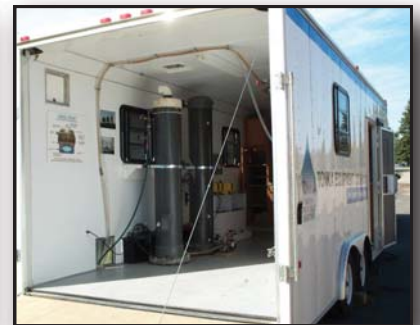
Tonka Pilot Trailer