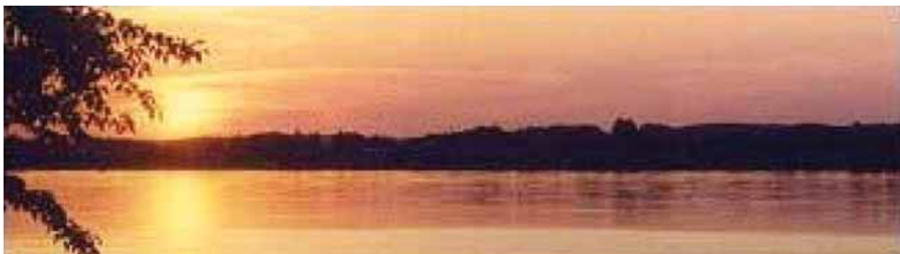
Sunset on Jackfish Lake

Tonka is proud to have the opportunity to provide high-quality drinking water to the residents and visitors around Jackfish Lake.