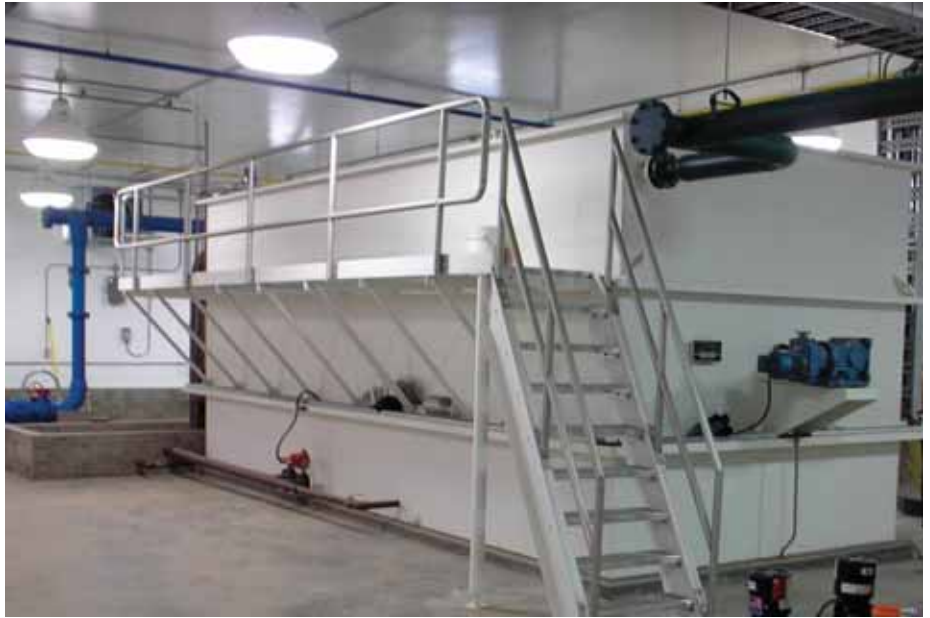
Tonka's UTS-P at the Jackfish Lake WTP

Jackfish Lake, located in Saskatchewan, Canada, is surrounded by recreational communities that boast of sandy swimming beaches, great boating, and breathtaking sunsets. The current residents living near Jackfish Lake realized that these attributes, along with good drinking water, could help draw residents from the nearby city of North Battleford to relocate in the pristine lake area. While the lake is a beautiful place, its water poses challenges to nearby communities who would like to use it for drinking water. Under normal conditions the water is quite turbid due to organic and inorganic particles. Furthermore, Jackfish Lake is a large warm-water lake, which leads to even higher turbidities when the wind picks up.