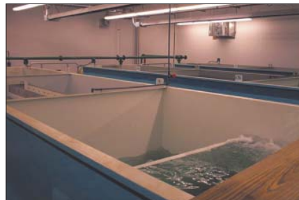
Unitized Treatment System Package Plant