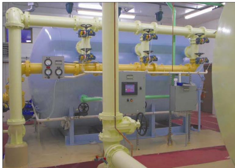
HMO Horizontal Pressure Filter

The people of the village of Germantown can be assured that they have excellent water quality and the most current and efficient technology for removing radium from their water source. ♦