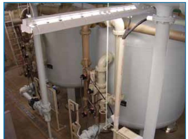
Tonka is proud to supply the first nitrate removal drinking water system in the state of Minnesota