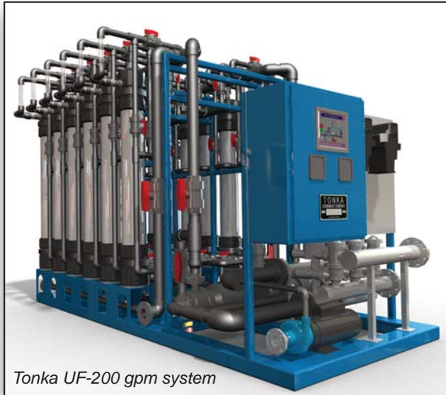
Tonka UF-200 gpm system

With advanced ultrafiltration technology available from Dow™, Tonka can solve the broadest range of your treatment challenges with guaranteed results