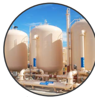
State-of-the-art Organix™ technology