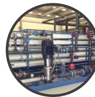
Forward thinking approach to water treatment