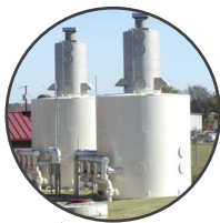
Tonka Water is founded